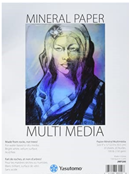
Yasutomo Mineral Paper Pad 9" x 12" 20 Sheets

The paper can be purchased in different size pads from Amazon. (I searched using the phrase "Mineral paper for artists").