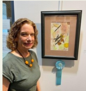
Paula Cohn , Untitled, Mixed Media Collage