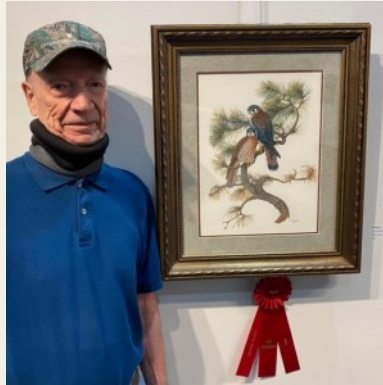
Carl McKinley , "Kestrels", Watercolor