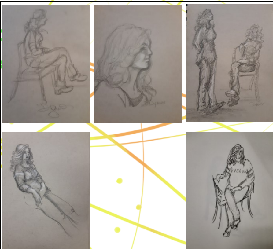
A few examples of our live model drawing last month.