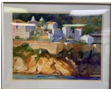
2nd Place - Mary Lou Hall "Climb the Light"