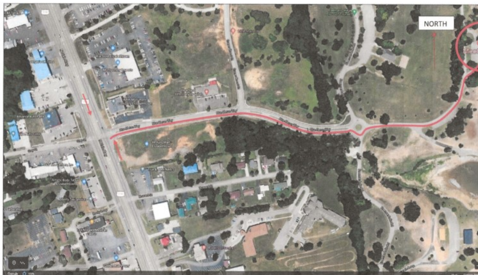
PLEIN AIR MAP