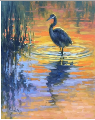
1st Place-Theresa Shelton “Wading at Sunset”