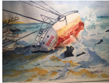
3rd Place—Joyce Lupresto “Storm”