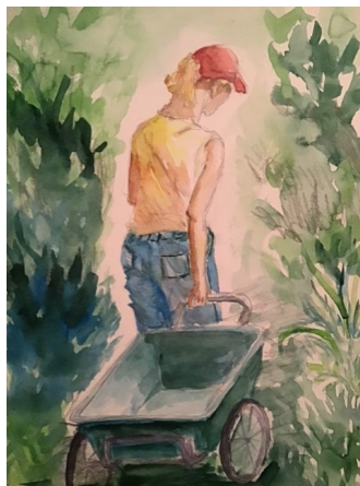
3rd Place—Terri Friel “Sunny Garden” watercolor