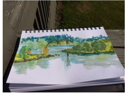
CKAG MEMBERS PLEIN AIR PAINT OUT AT FREEMAN LAKE