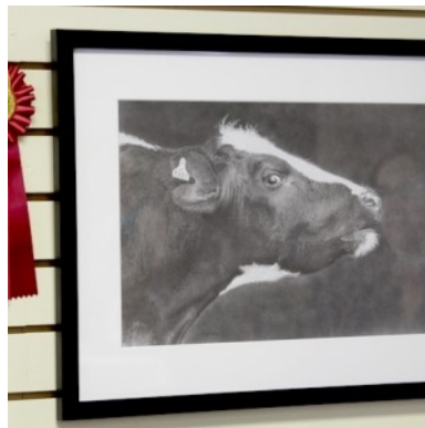
2nd Place—Joe Myers, "Cow Moo"